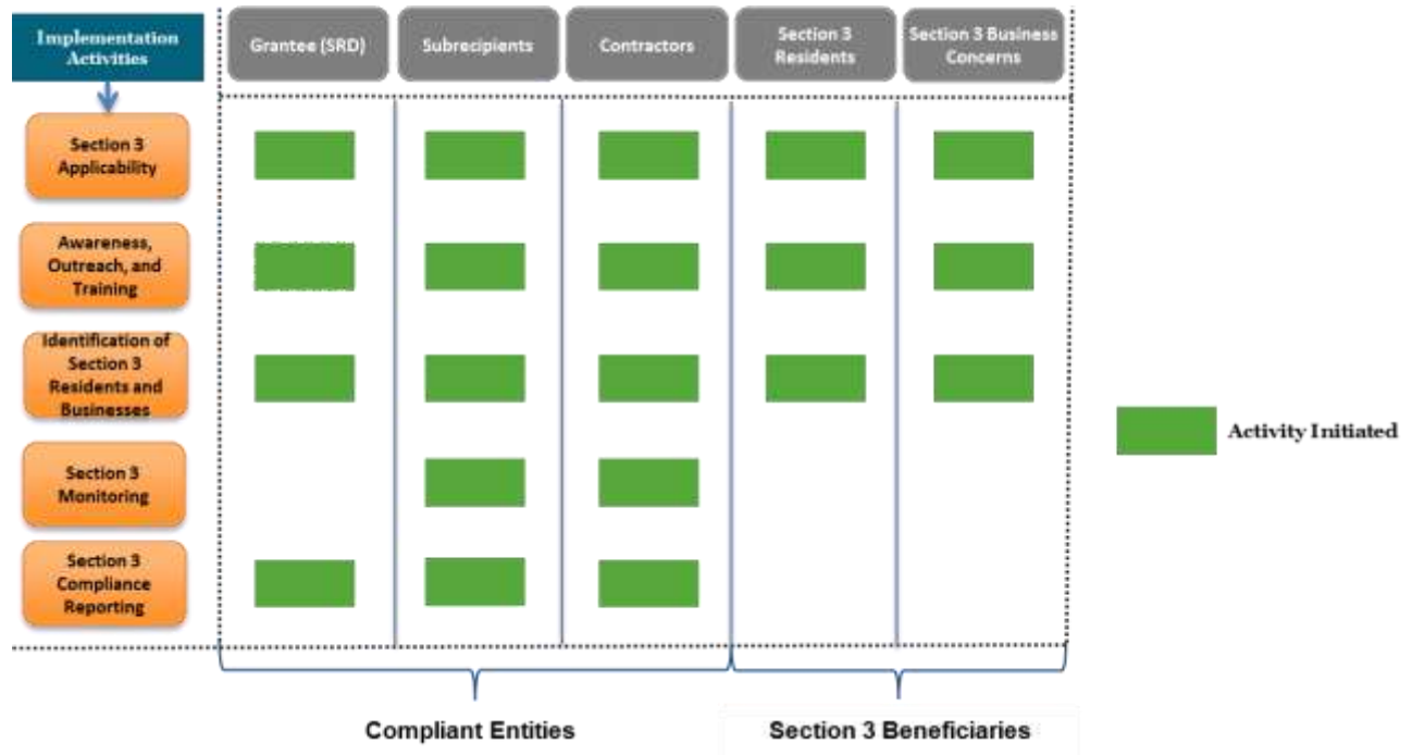
Exhibit A – Implementation Strategy 3

SRD will implement programs and activities to meet the Section 3 goals and objectives and to encourage consistent program compliance. Key implementation strategies are defined for each entity as a part of the implementation framework provided in the exhibit below: